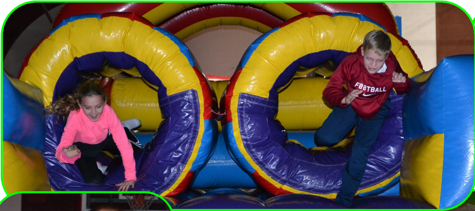
Green and Gold